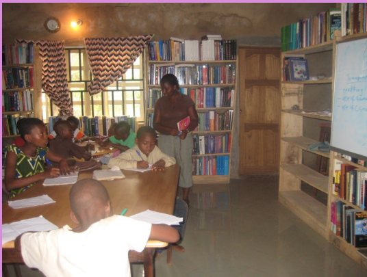
The Group Being Given Assistance with their School Work