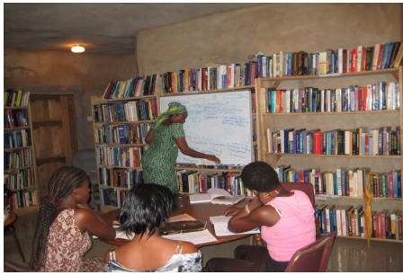
We Had Science Classes