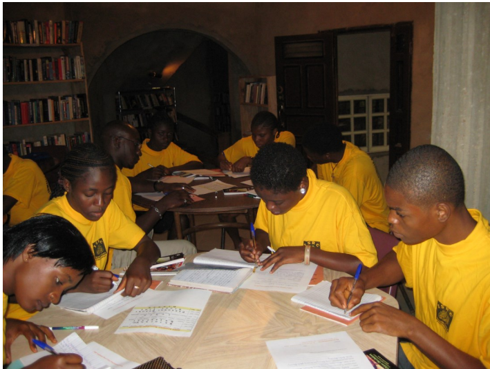
We Worked IN groups