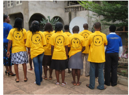
Global Fund For Women Gave Us A VSAT for Internet Connection