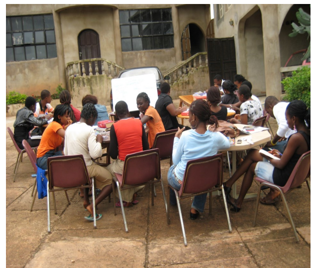
No Electricity? No problem. Classes Were held Outside