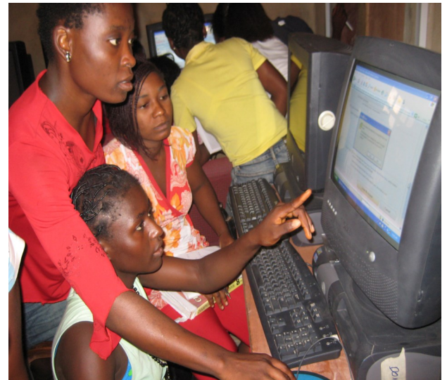
We Taught each Other