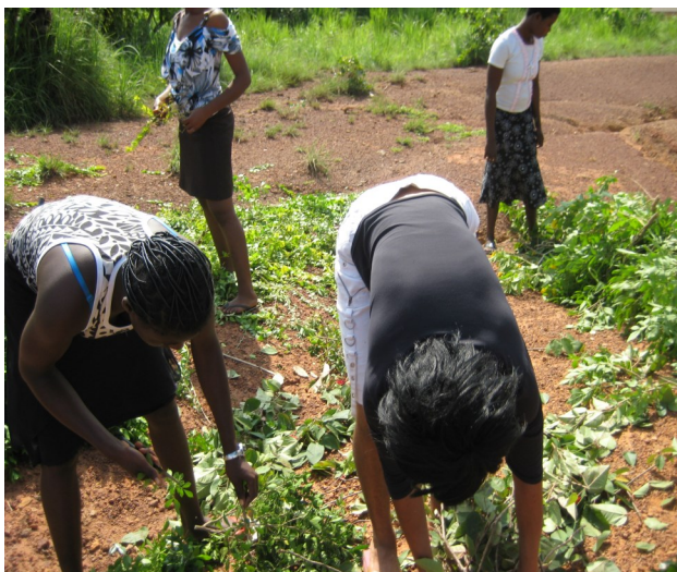
Taking Care of the Environment